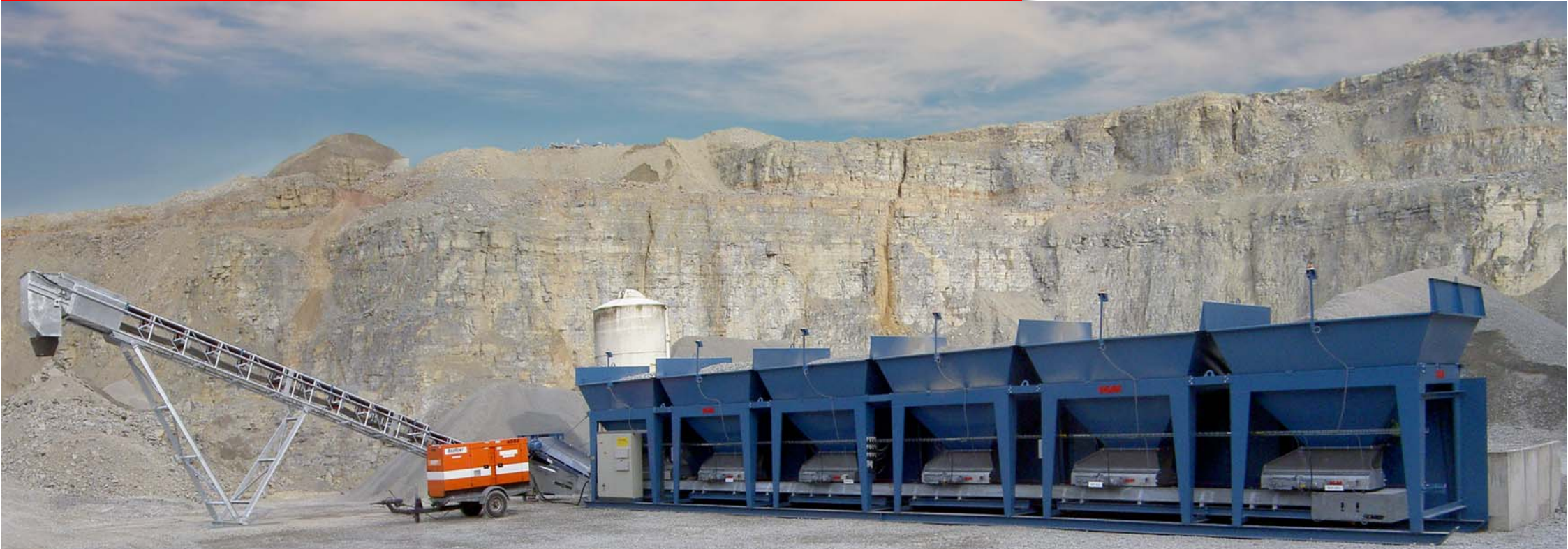
Photo : Euromix 400/6 with a 16,5m fixed loading conveyor