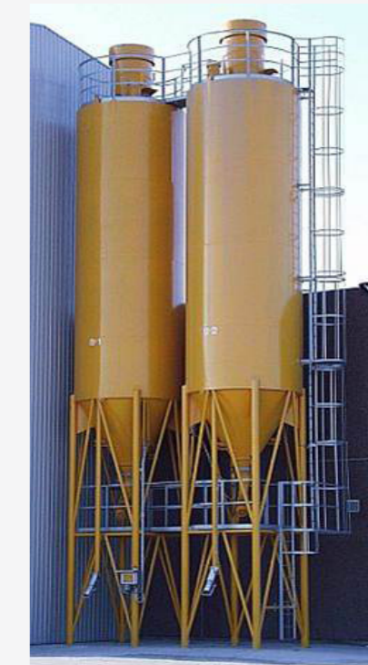
Cement silos from 30 to 200 t.